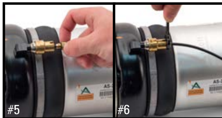
#5 INSERT FITTING AND AIRLINE INTO AIR SPRING